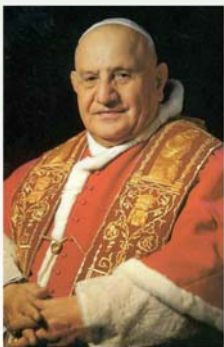
BLESSED JOHN XXIII

Pope John XXIII (Vatican II forerunner during his papacy) and John Paul II (Divine Mercy pope) who will join the list of Roman Catholic sainthood. It is a first in the history of the Roman Catholic Church that two popes will be canonized together in one canonical celebration by a concurrent Pope. ☐