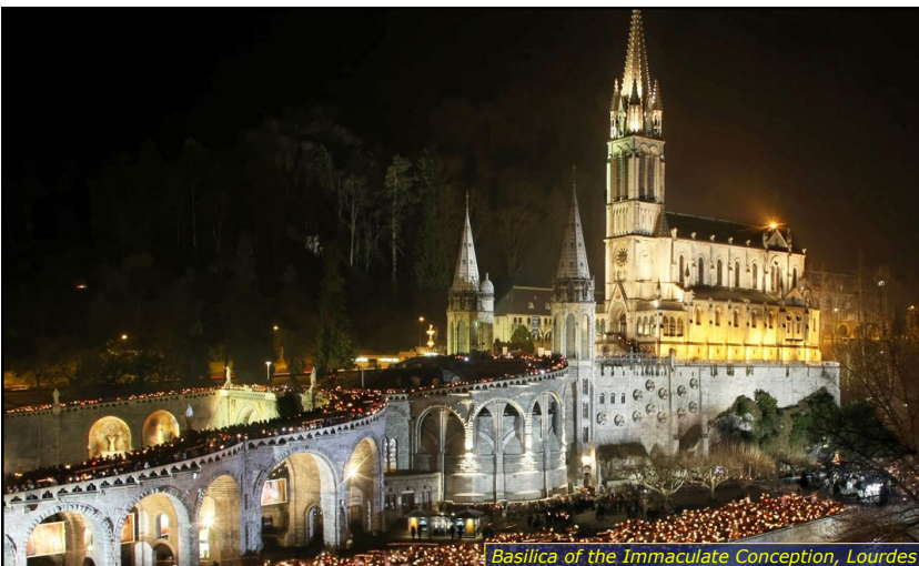
Basilica of the Immaculate Conception, Lourdes