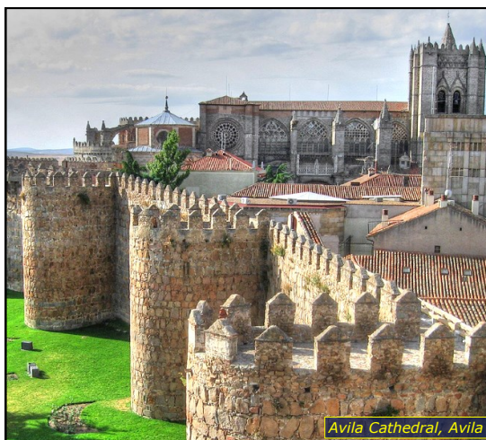
Avila Cathedral, Avila